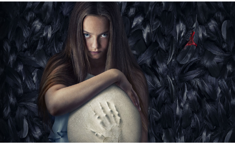
BIRDS OF A FEATHER / SILVA MYSTERIUM

Applicants may be invited to a Skype-interview during January 2017. Further materials will be requested upon selection.