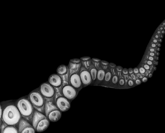
DEEP-DOWN / FANTEFILM FIKSJON

*) For example genres such as, but not limited to, fantasy, supernatural, western, mystery and more. Crime and thriller genres are expected to go beyond the ordinary, well-known formats.