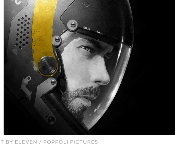
EAST BY ELEVEN / POPPOLI PICTURES