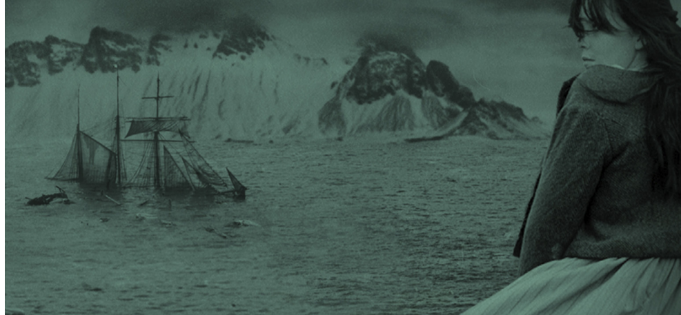
THE DAMNED / FILMBROS PRODUCTIONS