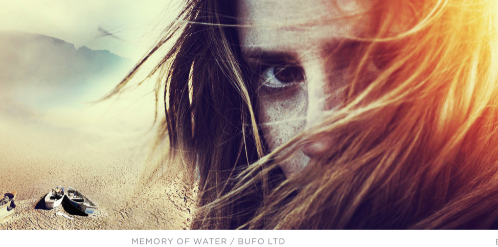
MEMORY OF WATER / BUFO LTD

Only feature film projects are accepted (yet, they may contain elements that can unfold across other media platforms). A minimum of 5 projects will be selected.