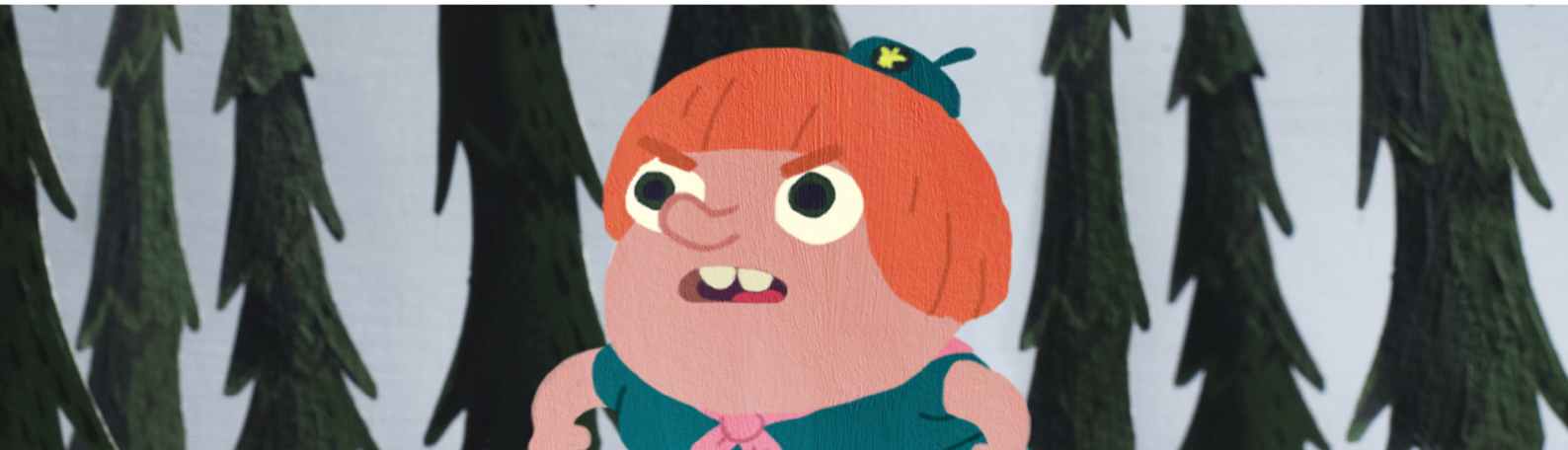
BENTE AND THE MUTANT SCOUTS / GOOD COMPANY FILMS

For the complete rules and regulations, please see the Nordic Genre Boost-guidelines on: www.nordiskfilmogtvfond.com/events